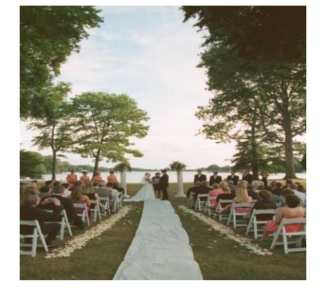
Queenstown, Maryland 21658