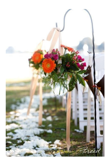
The ftoint at ftintail